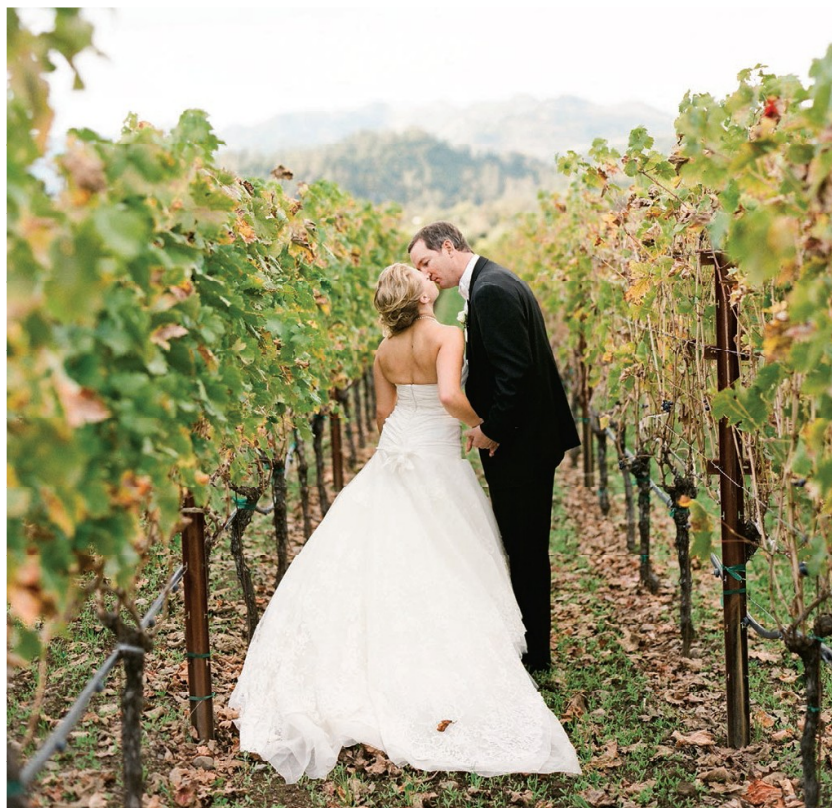
The couple shared a kiss in the vineyard at Greystone.