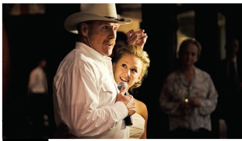
The couple wanted a "summer camp feel" and filled a festive weekend with wine country events.