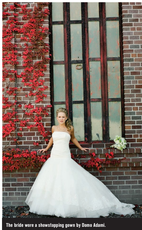
The bride wore a showstopping gown by Domo Adami.

THE PARTY: Guests danced the night away and grazed on a late-night doughnut bar. — Nerissa Pacio