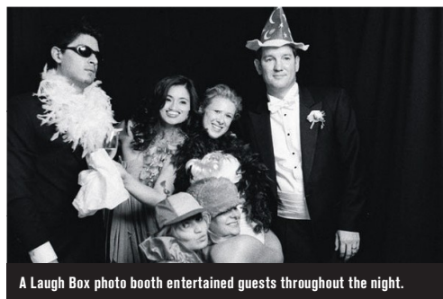
A Laugh Box photo booth entertained guests throughout the night.