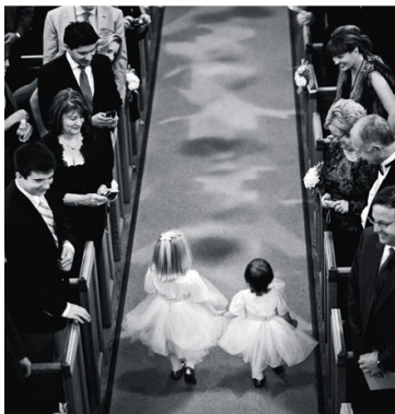
Flower girls led the procession at St. Helena Catholic Church.