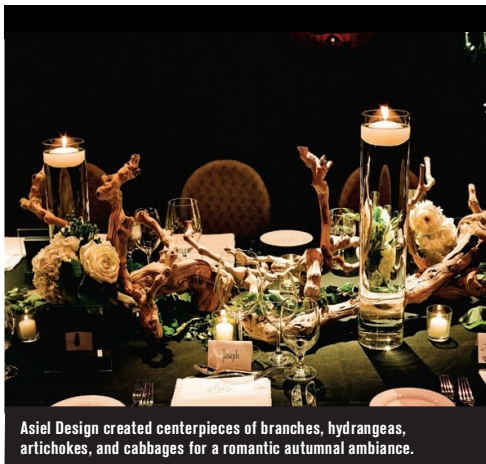
Asiel Design created centerpieces of branches, hydrangeas, artichokes, and cabbages for a romantic autumnal ambiance.